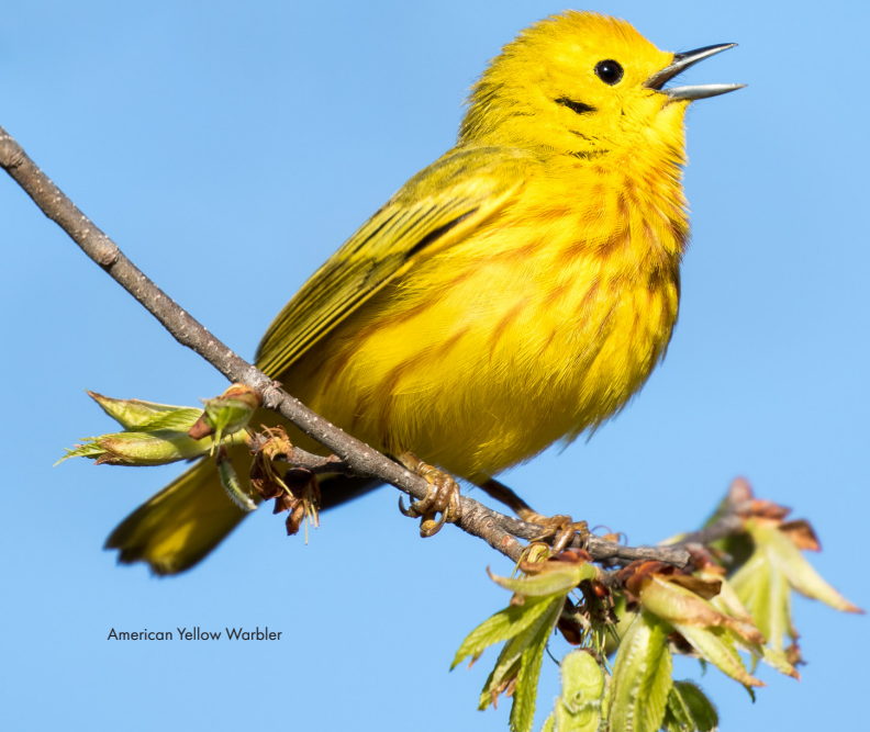
American Yellow Warbler

If you have questions and would like to speak to someone, or need help finding medical care, call the Los Angeles County Information line 2-1-1, which is available 24/7.